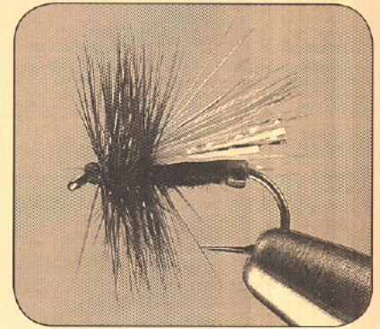
Garcia's Mother's Day Caddis

Greg Garcia of Colorado developed this version of the Mother's Day Caddis (MDC). The green glass bead at the bend imitates the egg sac of a female coming back to deposit her eggs in the evening. Greg enjoys good success at all stages of the hatch cycle with this pattern. He believes that anytime is a good time for caddis.